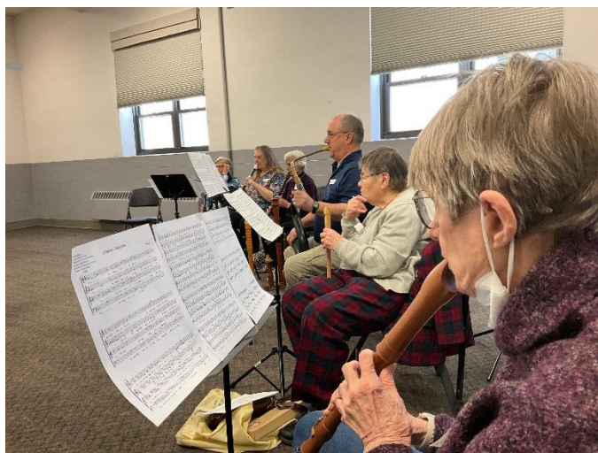
Chicago chapter members gather on March 19

A lot of our discussion addressed music theory. If you would like us to devote a future chapter meeting to a more detailed discussion of music theory, let us know.