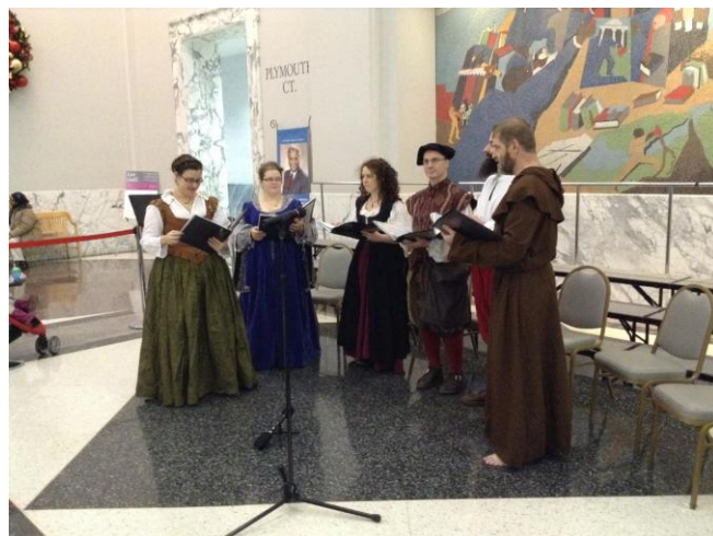
The Pippins at the Harold Washington Library, December 12