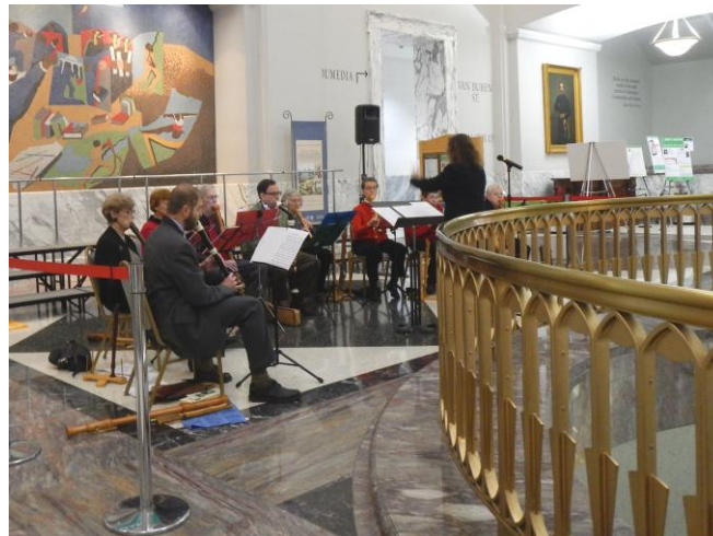
Chicago Chapter members at the Harold Washington Library, December 13