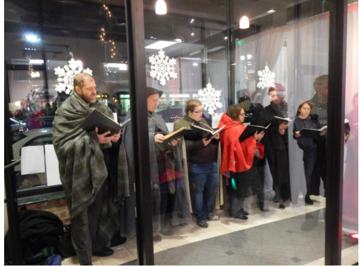
The Pippins, singing in a storefront of an insurance broker