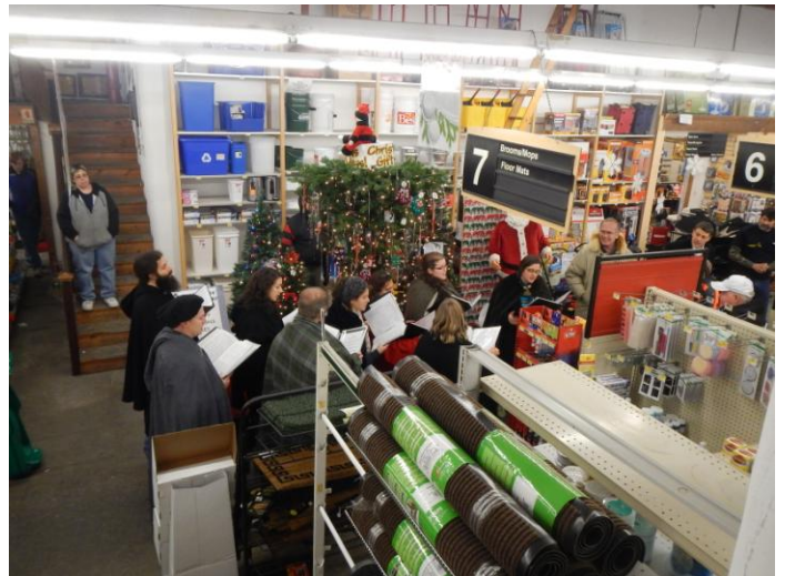
And singing in a hardware store, Holiday Windows in Forest Park, December 6