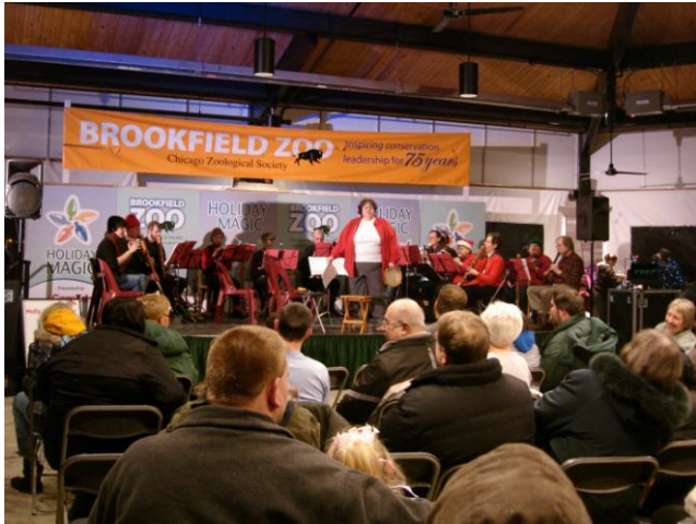
OPRS, Brookfield Zoo Holiday Magic, December 30