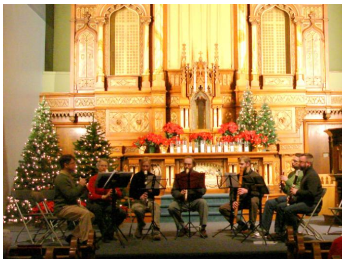
The Baron's Noyse

Performers featured some traditional Christmas carols, as well as two versions of O Magnum Mysterium , one by William Byrd (1543-1623) and the other by a Spanish