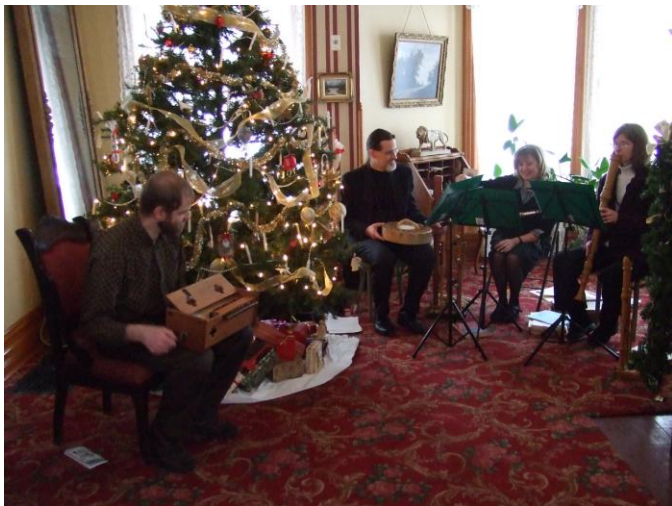
Home Street Recorder Ensemble at the Hemingway House, Oak Park, December 26, with visiting hurdy-gurdy artist